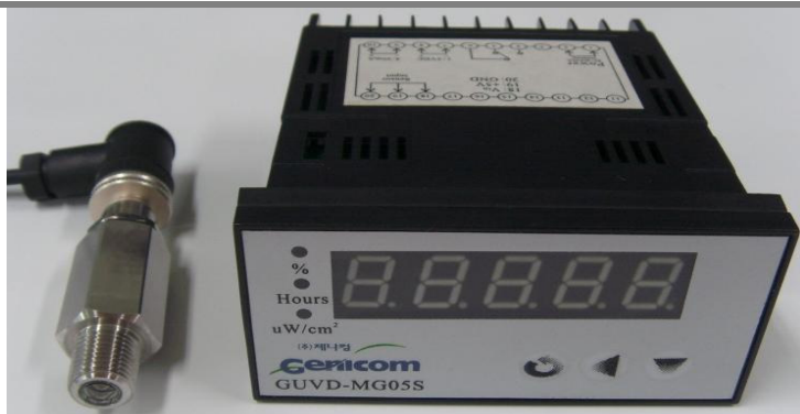
Fig. 1 UV Radiometer 5.0 (Size of Display : 97 × 50 × 112mm)