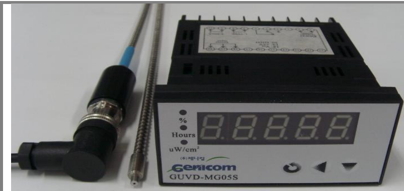
Fig. 1 UV Radiometer 5.0 (Size of Display : 97 × 50 × 112mm 3 )