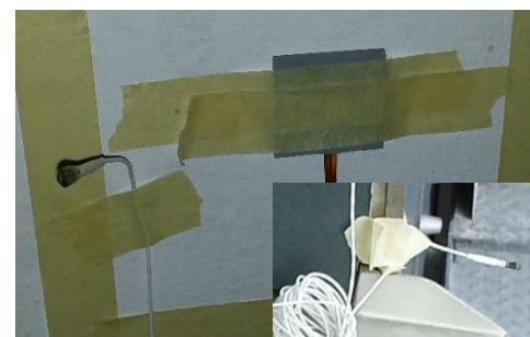
Figure 2: Above: Measurement set-up; heat flux sensor with inside temperature sensor, Bottom right: outside temperature sensor

The heat flux sensor has been attached to the inside of the wall. The inside temperature sensor is placed next to it, approximately 3-4 cm from the wall. The outside temperature sensor is also attached 3-4 cm away from the wall (and not influenced by direct sunlight).