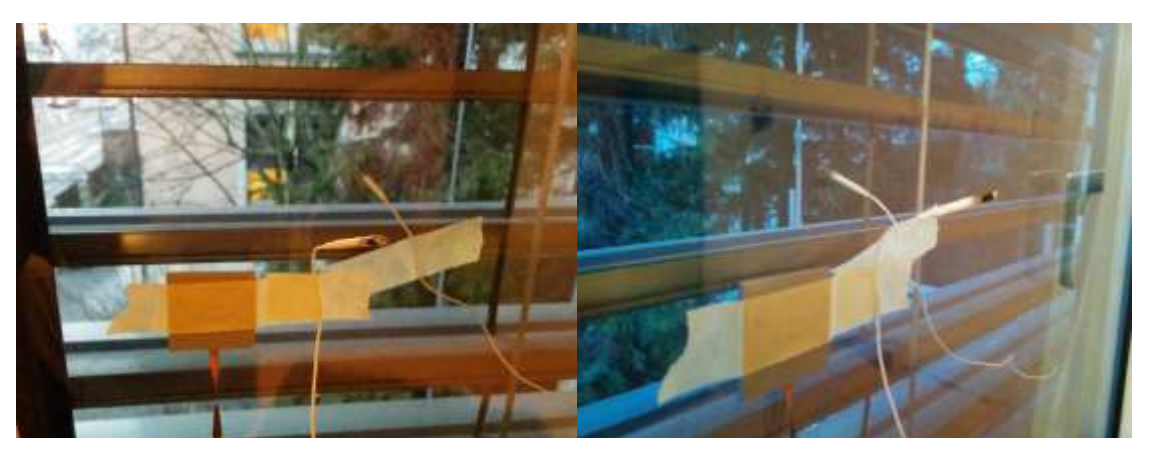
Figure 1: Measurement set-up: Window with metal exterior shutters; Heat flux sensor with 2 temperature sensors, one inside and one outside, both roughly 2 cm away from the glass.

The night measurements were all started a couple of hours after sunset and stopped early in the morning (to be in line with ISO 9869). The third measurement was stopped right after sunset but this did not have any influence on the measurement outcome. The day measurement has been started in the morning and stopped at the beginning of the evening before sunset. During the measurement there was no activity in the room. The measurements were evaluated with the greenTEG Software (V1.00.03).