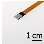
gSKIN ® -XM