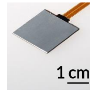
gSKIN ® -XI