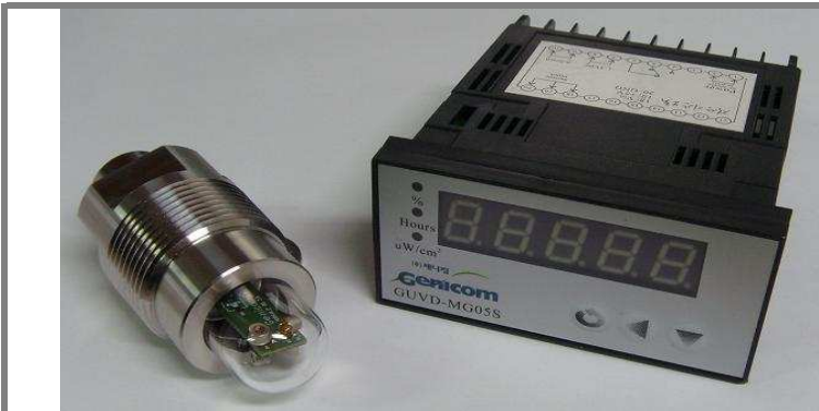
Fig. 1 UV Radiometer 5.0 (Size of Display : 96 × 48 × 112mm 2 )