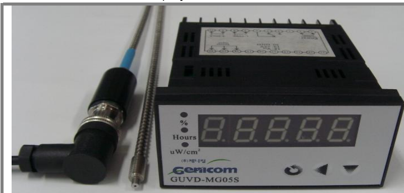
Fig. 1 UV Radiometer 5.0 (Size of Display : 97 × 50 × 112mm 3 )