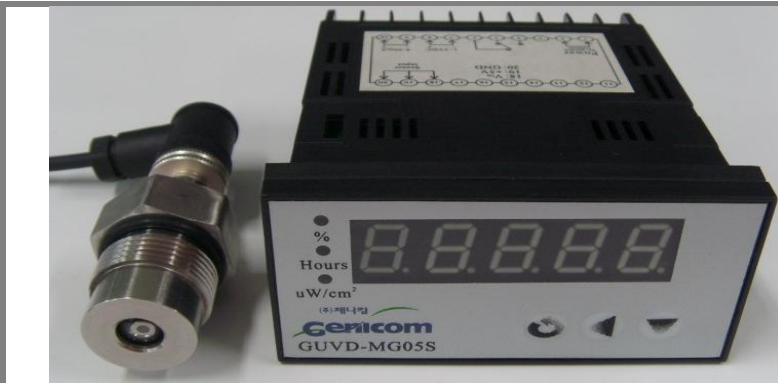
Fig. 1 UV Radiometer 5.0 (Size of Display : 97 × 50 × 112mm)