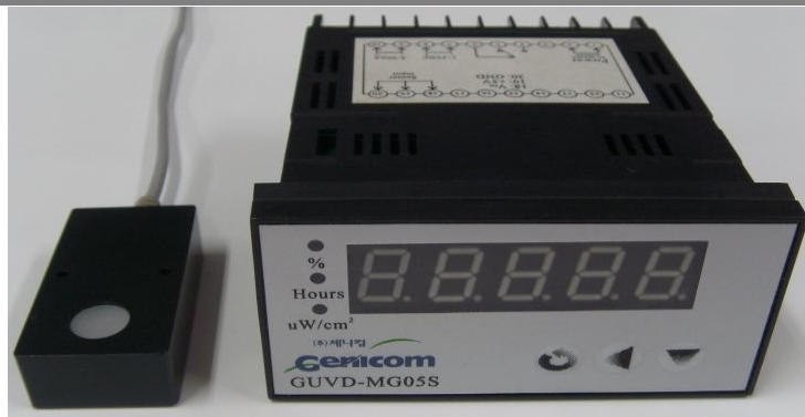
Fig. 1 UV Radiometer 5.0 (Size of Display : 97 × 50 × 112mm)