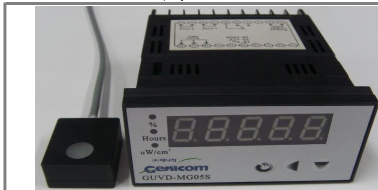
Fig. 1 UV Radiometer 5.0 (Size of Display : 97 × 50 × 112mm)