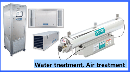
Water treatment, Air treatment