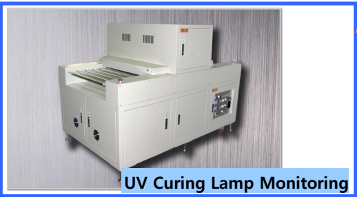
UV Curing Lamp Monitoring