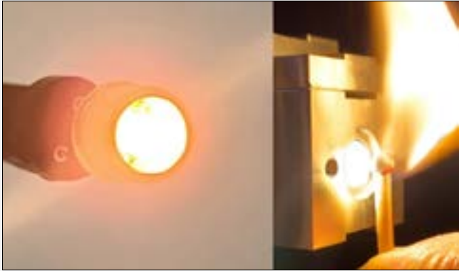
Fig. 1: High-temperature thermal IR emitter in TO-39 package with broadband emittance in the (1...6) \mu\text{m} wavelength range.