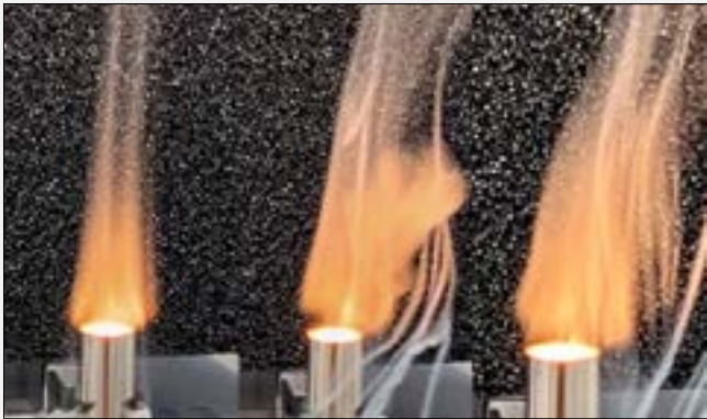
Fig. 3: Too hot to handle – but the emitters vaporize liquids immediately.